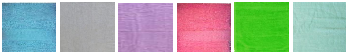
turquoise cool grey lavender hot pink lime green mint

*Dave Seehafer, 949-466-4110, INFO@GLOBALWAVEVENTURES.COM to put more $$$ in your pocket*